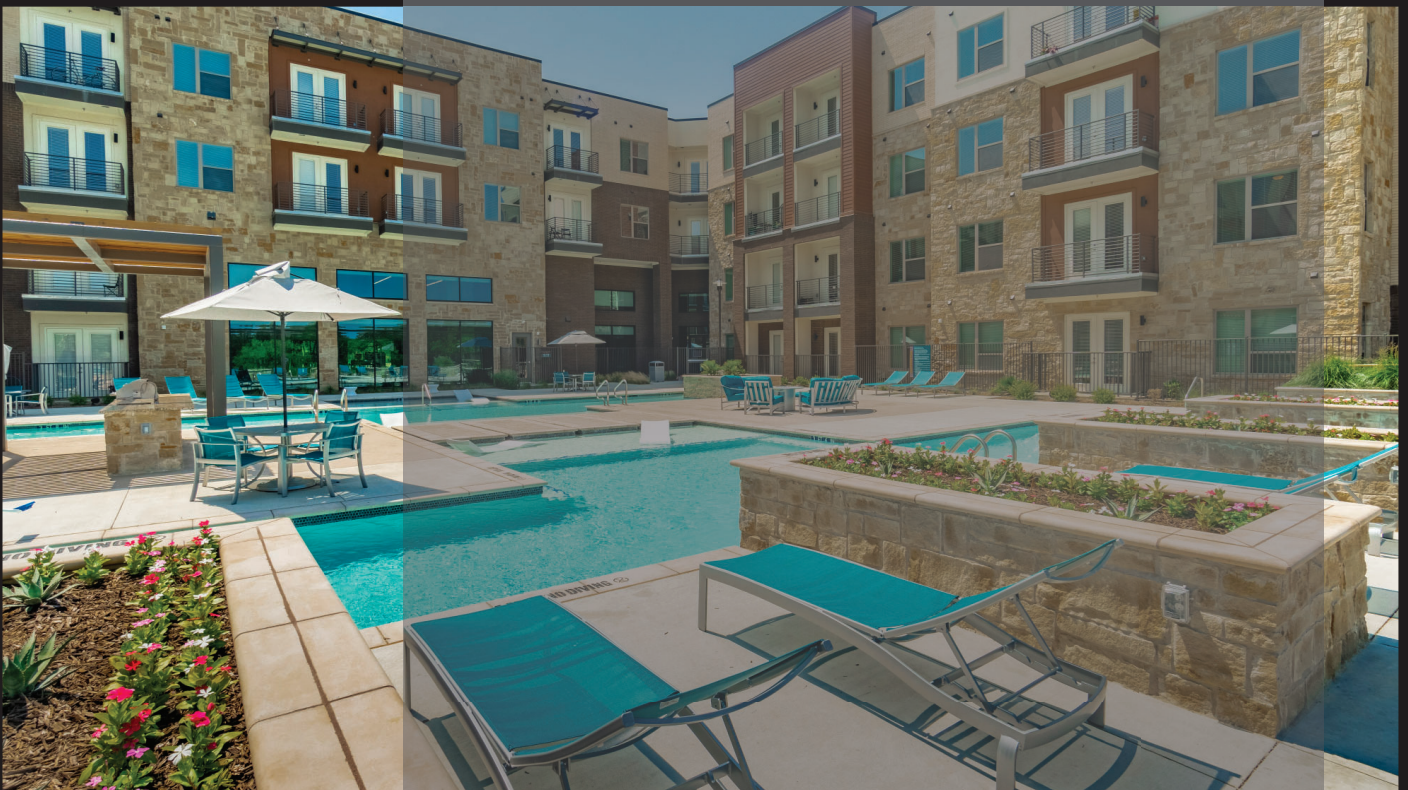
MILLENNIUM PLACE IN CORINTH, TEXAS

SunRidge celebrates over 30 years of service as the industry leader in multi-family property management. We haven't made it this far because we're lucky. With more than a century's worth of experience among our leadership team, our continued success is a testament to our commitment to achieving long-term profitability and enhanced value for our clients.