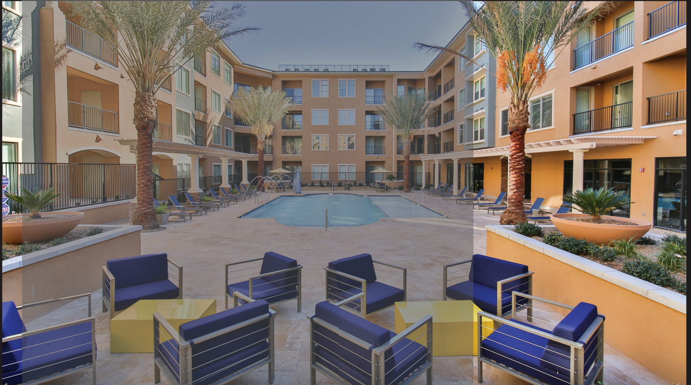
ABODE RED ROCK IN LAS VEGAS, NEVADA